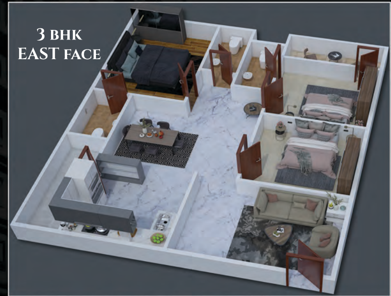
3 BHK EAST FACE