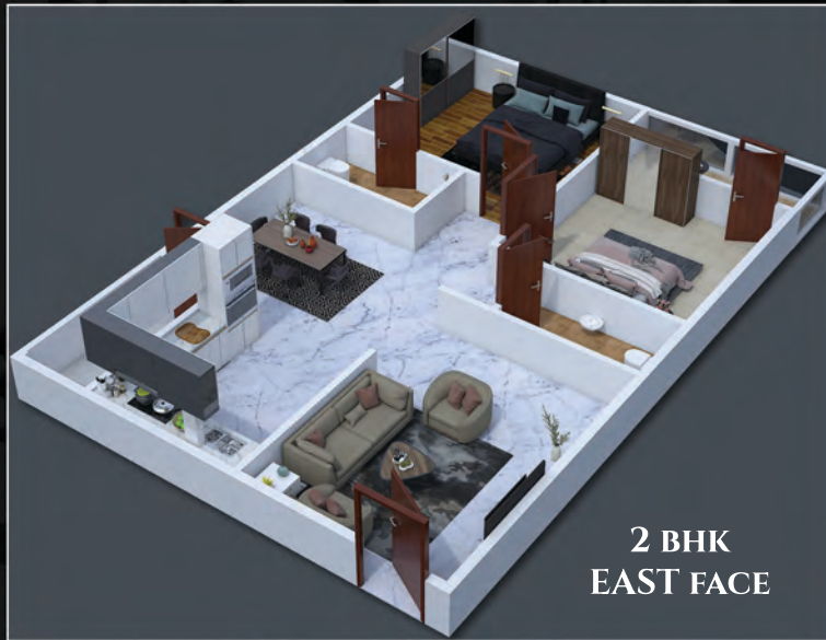
2 BHK EAST FACE