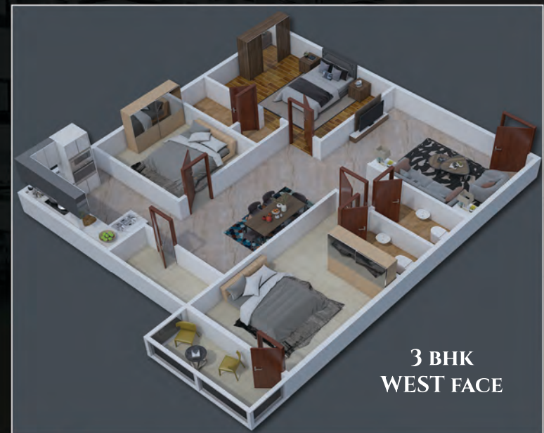
3 BHK WEST FACE