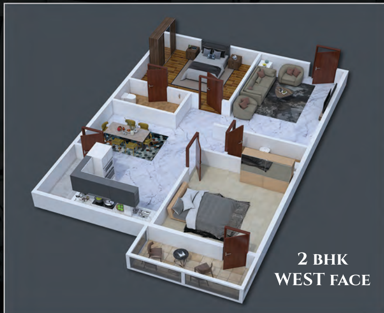
2 BHK WEST FACE